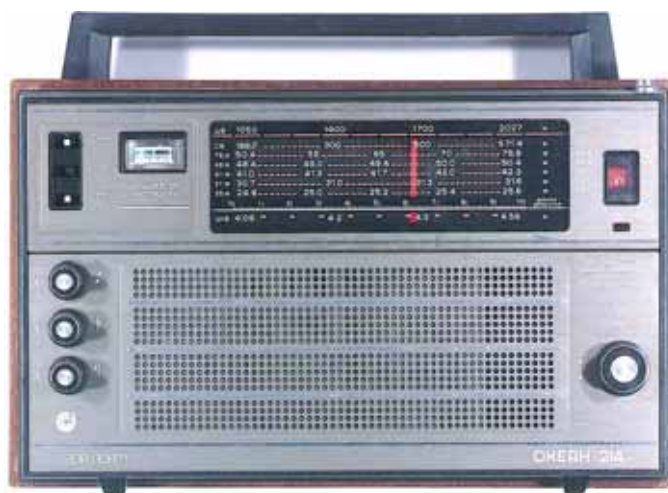
Figure 1. The radio that has been used in this study

To understand what this flaw is, I decided to follow the advice of my high school mathematics teacher, who recommended testing an approach by applying it to a problem that has a known solution. To abstract from peculiarities of biological experimental systems, I looked for a problem that would involve a reasonably complex but well understood system. Eventually, I thought of the old broken transistor radio that my wife brought